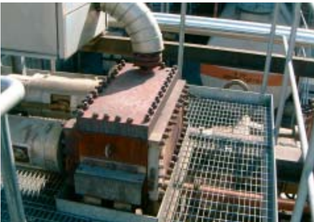
Distillation column light oil preheater

The five Alfa Laval Compabloc heat exchangers are installed in the benzene recovery part of the SSAB coke oven plant. Prior to installing the Compabloc units, SSAB had used other