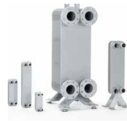
AlfaNova fusion-bonded plate heat exchangers are available in a wide range of sizes and capacities. Let us help you choose the right model for your application.

Cleaning with a CIP unit is a cost-effective way to achieve better performance. The environmentally friendly cleaning agents used extend AlfaNova's operating time between cleaning cycles, prolonging the lifetime of the heat exchanger, without damaging the plates.